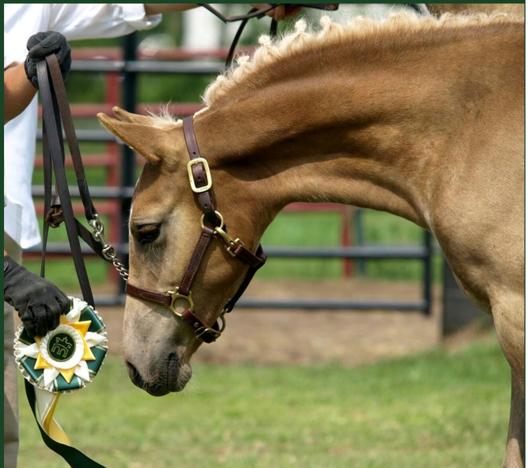
Visit newhorizonshafingers.com for more photos of Stellar, or on Facebook at New Horizons Haflinger Sport Horses/New Horizons Farm LLC.

In addition to competing and breeding Stellar in the future, our hopes are to breed to Brenner IK to produce a B-line stud colt in the near future, and eventually, to find and/or produce an S-line stud colt, to continue these two rarest of lines in the Haflinger breed in North America.